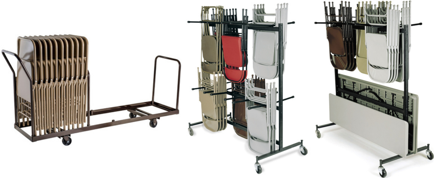
Vertical Folding Chair Cart Capacity: 35 Chairs Dimensions: 19 1/4"W x 81"D x 38 1/2"H

Let us help you find the perfect storage and transport solution for your folding chairs!