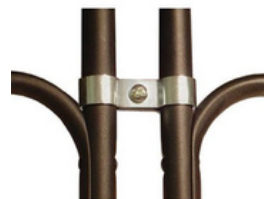
Plastic Ganging Clamps