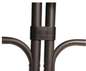
Metal Ganging Clamps