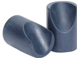
Chair V-Tip Caps