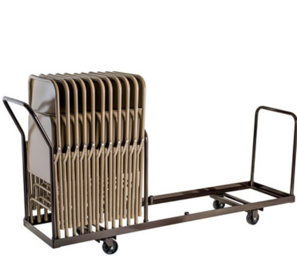
Vertical Folding Chair Cart Capacity: 35 Chairs Dimensions: 19 1/4"W x 81"D x 38 1/2"H

Let us help you find the perfect storage and transport solution for your folding chairs!