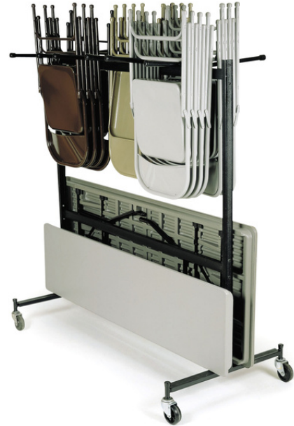
Double Tier Folding Chair & Table Cart Capacity: 42 Chairs & 8-12 tables Dimensions: 67"W x 33 1/4"D x 70"H