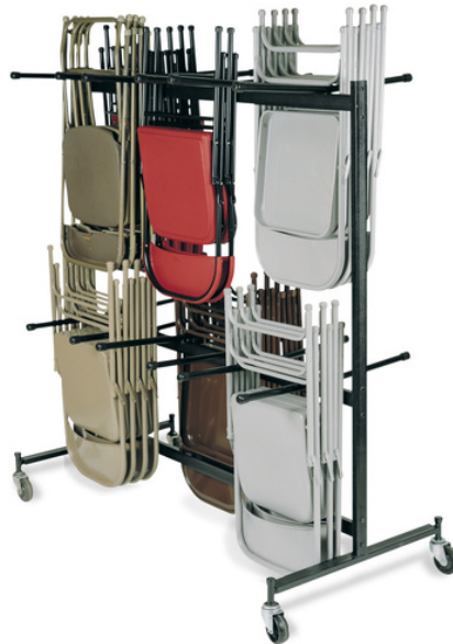
Double Tier Folding Chair Cart Capacity: 84 Chairs Dimensions: 67"W x 33 1/4"D x 70"H